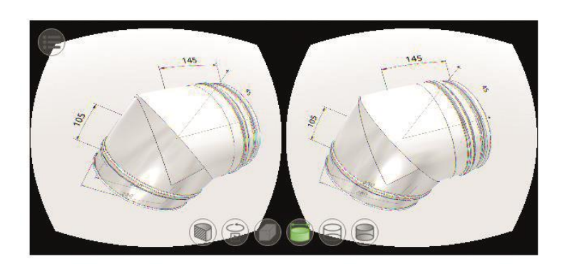
Caption 3: With a cardboard viewer and smartphones, architects can look at 3D models.

This press release and accompanying images are available for download from our website: <a href="https://www.cadenas.de/press/press-releases">www.cadenas.de/press/press-releases</a>